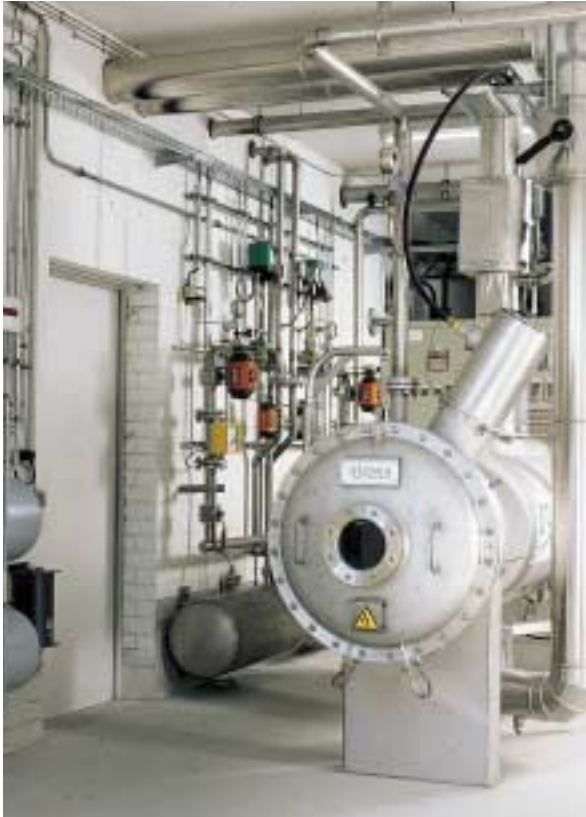
Fig. 3: Ozone generator