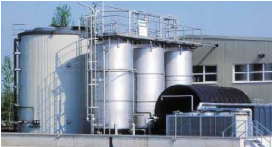
Fig. 1: Oxidation tanks; 2 contact tanks with Ozonia Radial Diffusers, 1 post-reaction

Since June 1994, the Salzgitter-Diebesstieg landfill has been operated by the "Disposal Centre Salzgitter GmbH" as a municipal waste landfill for the urban area of Salzgitter. The permit for this landfill stipulated that a plant be constructed for treating the accumulating leachate. Based on the water quality requirements for direct discharge into a waterway, from Appendix 51 of the "Rahmenabwasser - Verwaltungs-vorschrift" dated 1-1-90, it was decided to install a treatment plant using the most current technology. For technical and economic reasons the treatment method speci-