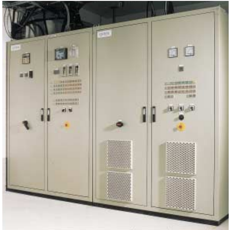
Fig. 4: Process control and power supply (PSU)

Leachate water flow rate: 3 m 3 /h Ozone production: 7.5 kg/h; Phase I 15.0 kg/h; Phase II Ozone concentration: 10 wt % (148 g/m 3 STP) Ozone contacting system: 2 stage with Ozonia Radial Diffusers Vent ozone destruction: thermal system with heat recovery Treatment standard: for direct discharge to a waterway