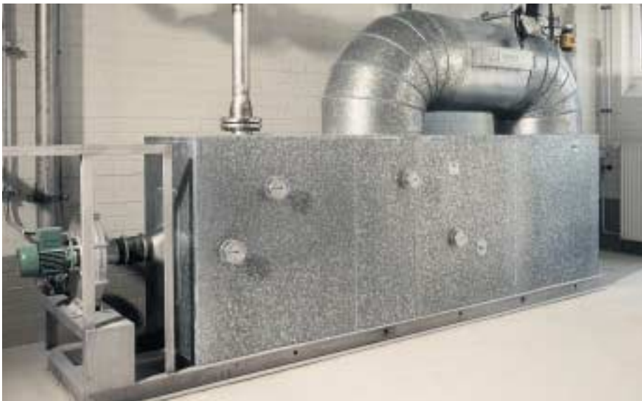
Fig. 5: Vent ozone destructor